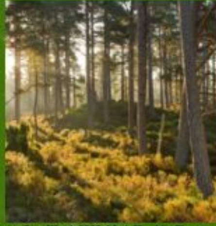
Caledonian Pine Wood, 2007