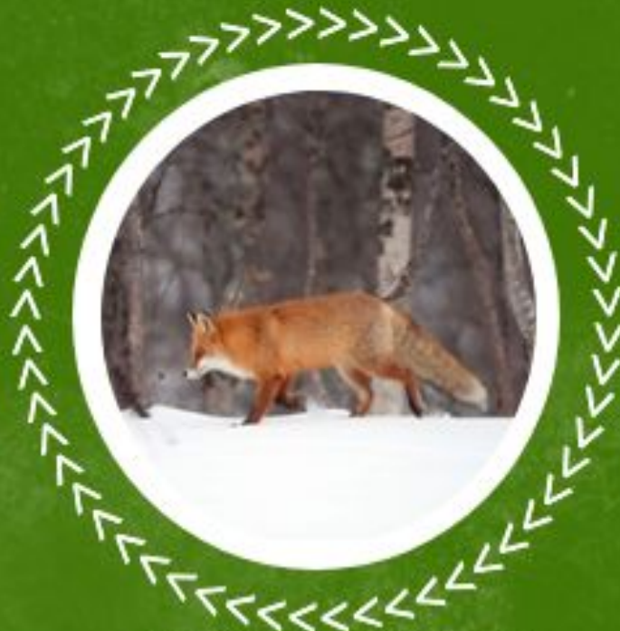
Fox806751, 2008