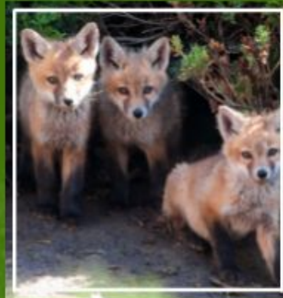
Red Fox Babies, 2013