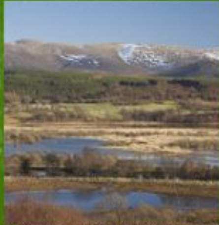
Inish Marshes, 2008