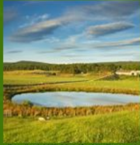
Farm Pond, 2006