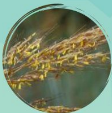
Indian Grass in Flower, March 12, 2019, Missouri Department of Conservation.