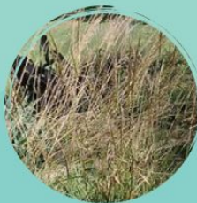
Sorghastrum Nutans , March 12, 2019, Missouri Botanical Garden.