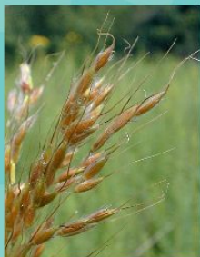
Close-up of Spikelets, March 12, 2019, Illinois Wildflowers.