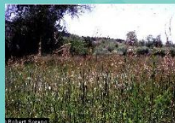
Sorghastrum nutans (L.) Nash - Indiangrass SONU2, March 12, 2019, Smithsonian Institution.