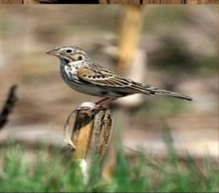
Vesper Sparrow, 2019 , Wikipedia.com