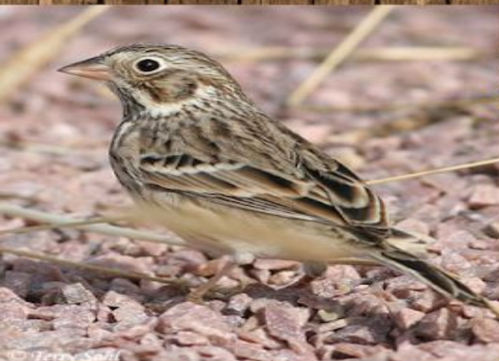
Vesper Sparrows, 2019

Most Vesper Sparrows are discovered before January 15th, although a few have overwintered. These birds become inconspicuous, but the largest flocks were composed of 20-35 birds.