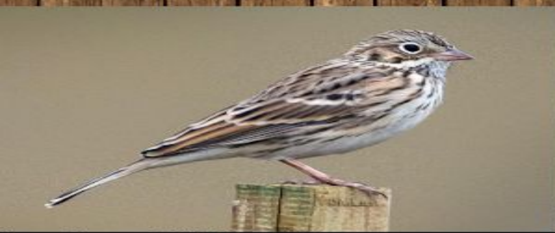
Vesper Sparrow, 2019

Vesper Sparrows breed in open areas such as, sparse grass and scattered shrubs including, old fields, pastures, weedy fence lines and roadsides, hay fields, and native grass lands. In the West, Vesper Sparrows usually breed in mountain meadows, grassy mesas, and sagebrush steppe.