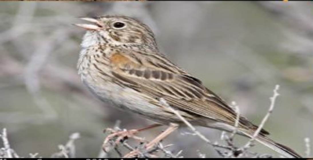
Vesper Sparrow, 2019

Song, throatier than that of a song sparrow; usually begins with 2 clear minor notes, followed by 2 higher ones. This type of sparrow will sing its lovely voice at twilight.